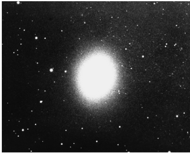
Figure 26.8 Dwarf Elliptical Galaxy. M32, a dwarf elliptical galaxy and one of the companions to the giant Andromeda galaxy M31. M32 is a dwarf by galactic standards, as it is only 2400 light-years across.