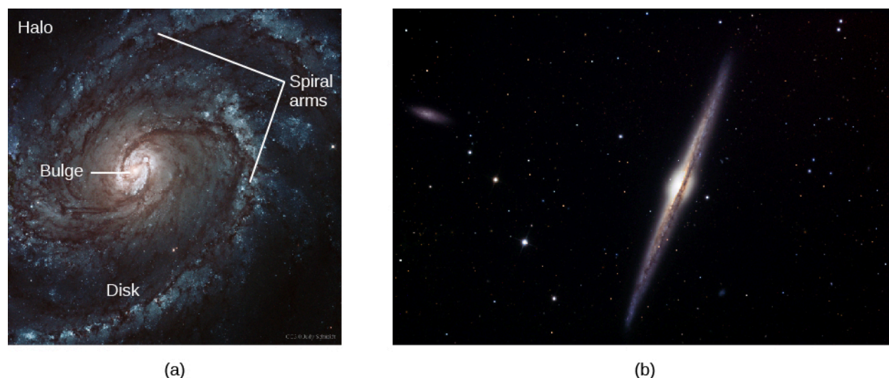
Figure 26.4 Spiral Galaxies. (a) The spiral arms of M100, shown here, are bluer than the rest of the galaxy, indicating young, high-mass stars and star-forming regions. (b) We view this spiral galaxy, NGC 4565, almost exactly edge on, and from this angle, we can see the dust in the plane of the galaxy; it appears dark because it absorbs the light from the stars in the galaxy. (credit a: modification of work by Hubble Legacy Archive, NASA, ESA, and Judy Schmidt; credit b: modification of work by "Jschulman555"/ Wikimedia)

Our own Galaxy and the Andromeda galaxy are typical, large spiral galaxies (see Figure 26.2 ). They consist of a central bulge, a halo, a disk, and spiral arms. Interstellar material is usually spread throughout the disks of spiral galaxies. Bright emission nebulae and hot, young stars are present, especially in the spiral arms, showing that new star formation is still occurring. The disks are often dusty, which is especially noticeable in those systems that we view almost edge on ( Figure 26.4 ).