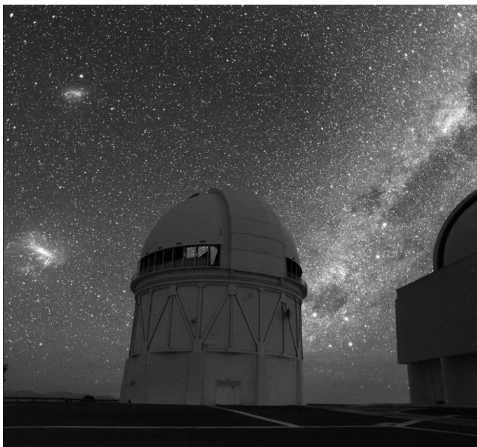
Figure 26.9 4-Meter Telescope at Cerro Tololo Inter-American Observatory Silhouetted against the Southern Sky. The Milky Way is seen to the right of the dome, and the Large and Small Magellanic Clouds are seen to the left.

The Small Magellanic Cloud is considerably less massive than the Large Magellanic Cloud, and it is six times longer than it is wide. This narrow wisp of material points directly toward our Galaxy like an arrow. The Small Magellanic Cloud was most likely contorted into its current shape through gravitational interactions with the Milky Way. A large trail of debris from this interaction between the Milky Way and the Small Magellanic Cloud has been strewn across the sky and is seen as a series of gas clouds moving at abnormally high velocity, known as the Magellanic Stream. We will see that this kind of interaction between galaxies will help explain the irregular shapes of this whole category of small galaxies,