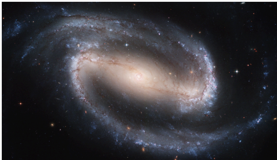
Figure 26.5 Barred Spiral Galaxy. NGC 1300, shown here, is a barred spiral galaxy. Note that the spiral arms begin at the ends of the bar.

About two-thirds of the nearby spiral galaxies have boxy or peanut-shaped bars of stars running through their centers ( Figure 26.5 ). Showing great originality, astronomers call these galaxies barred spirals.